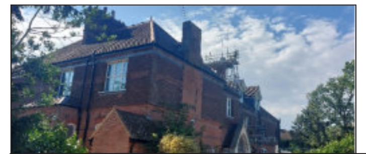
Work has started on the construction of a new SEND school at the Karibou Centre on the Wells.

In a further development, the six newly elected Surrey Lib Dem MPs are pushing the Conservative County Council to reverse a new decision to give parents a month, rather than six months, to make their placement preferences suggesting that it is an "unacceptably short time frame".