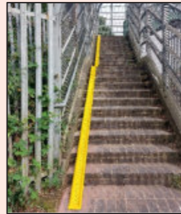
The new cycle track on the Castle Road pedestrian bridge.

Lib Dem councillor Alison Kelly is delighted to report a success; disappointed by the delay in the replacing the rail bridge from Castle Road on to the common, she requested that a bike track be added to the pedestrian bridge, having watched cyclists struggle to carry their bikes over the bridge.