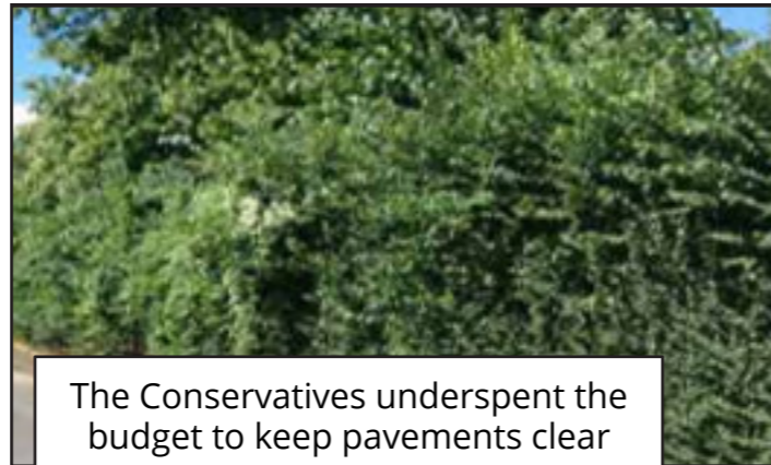
The Conservatives underspent the budget to keep pavements clear