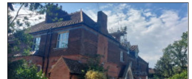
Work has started on the construction of a new SEND school at the Karibou Centre on the Wells.

In a further development, the six newly elected Surrey Lib Dem MPs are pushing the Conservative County Council to reverse a new decision to give parents a month, rather than six months, to make their placement preferences suggesting that it is an "unacceptably short time frame".