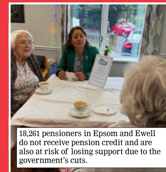
18,261 pensioners in Epsom and Ewell do not receive pension credit and are also at risk of losing support due to the government's cuts.

Older people across Epsom and Ewell are being failed by the new Labour Government.