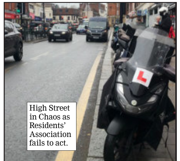
High Street in Chaos as Residents’ Association fails to act.

While the Resident Association sits idle, the Lib Dems are stepping up. They’re out in the community, knocking on doors and pledging to put residents first. Epsom’s moped mayhem represents another Residents’ Association plan that is yet to be delivered.