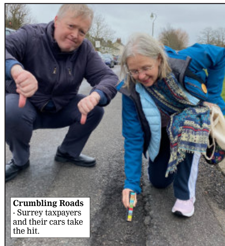
Crumbling Roads - Surrey taxpayers and their cars take the hit.